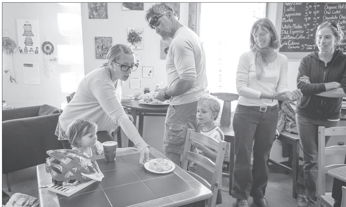
ART SHOW: The Trailhead Children's Museum hosted an art show at Rumors on Wednesday, May 11.