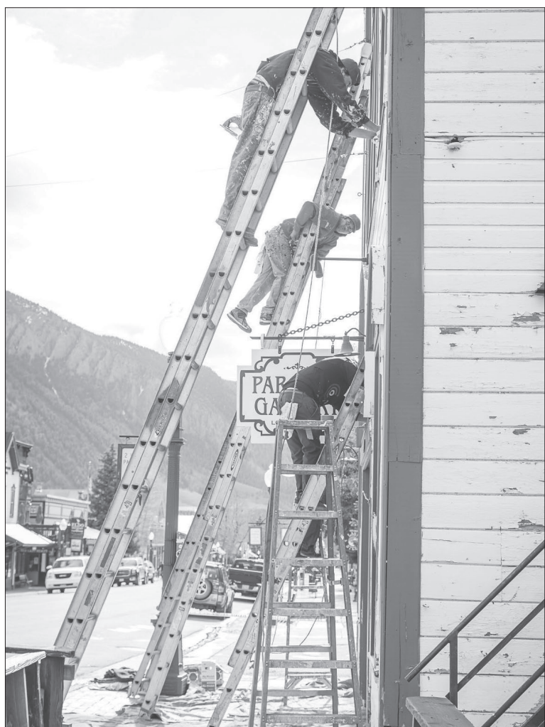
FACE LIFT: Old Town Hall received a fresh coat of paint recently.