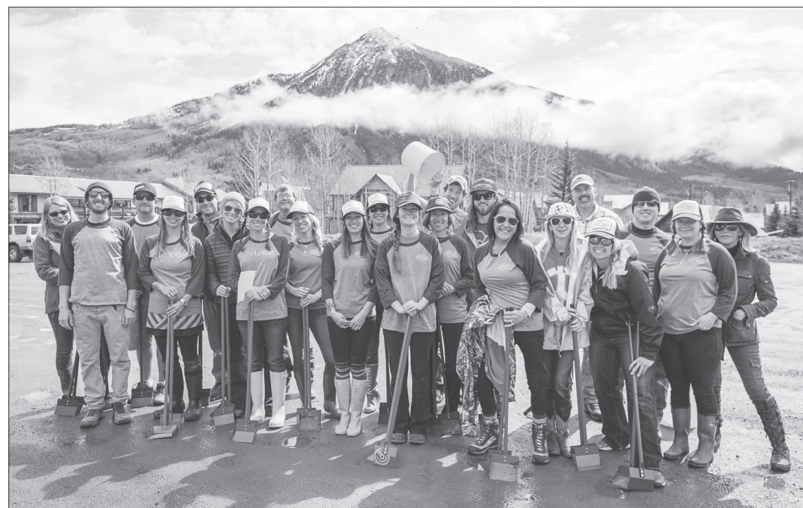
POO PICK-UP: Oh Be Dogful recruited volunteers to clean up doggie doo-doo around town on Sunday, May 15.