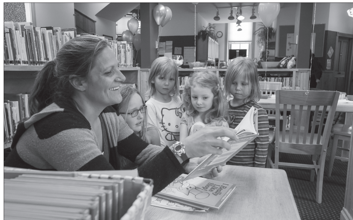
READING TIME: The Old Rock Library hosted a book bash on Sunday afternoon.