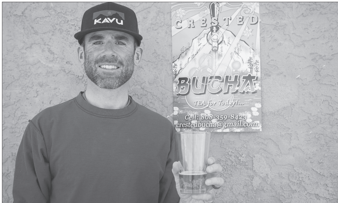
FRESH KOMBUCHA: Crested Bucha is producing fresh and delicious kombucha right here in Crested Butte! It is being served on tap at The Local Market in Gunnison as well as on Third and Belleview in Crested Butte. Please bring your own jar. A little tea every day goes a long way!