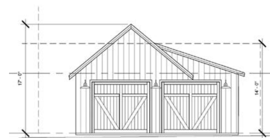
4 Elevation GARAGE WEST 1/8" = 1'-0"

TOWN OF CRESTED BUTTE By Jessie Earley, Building Department Assistant