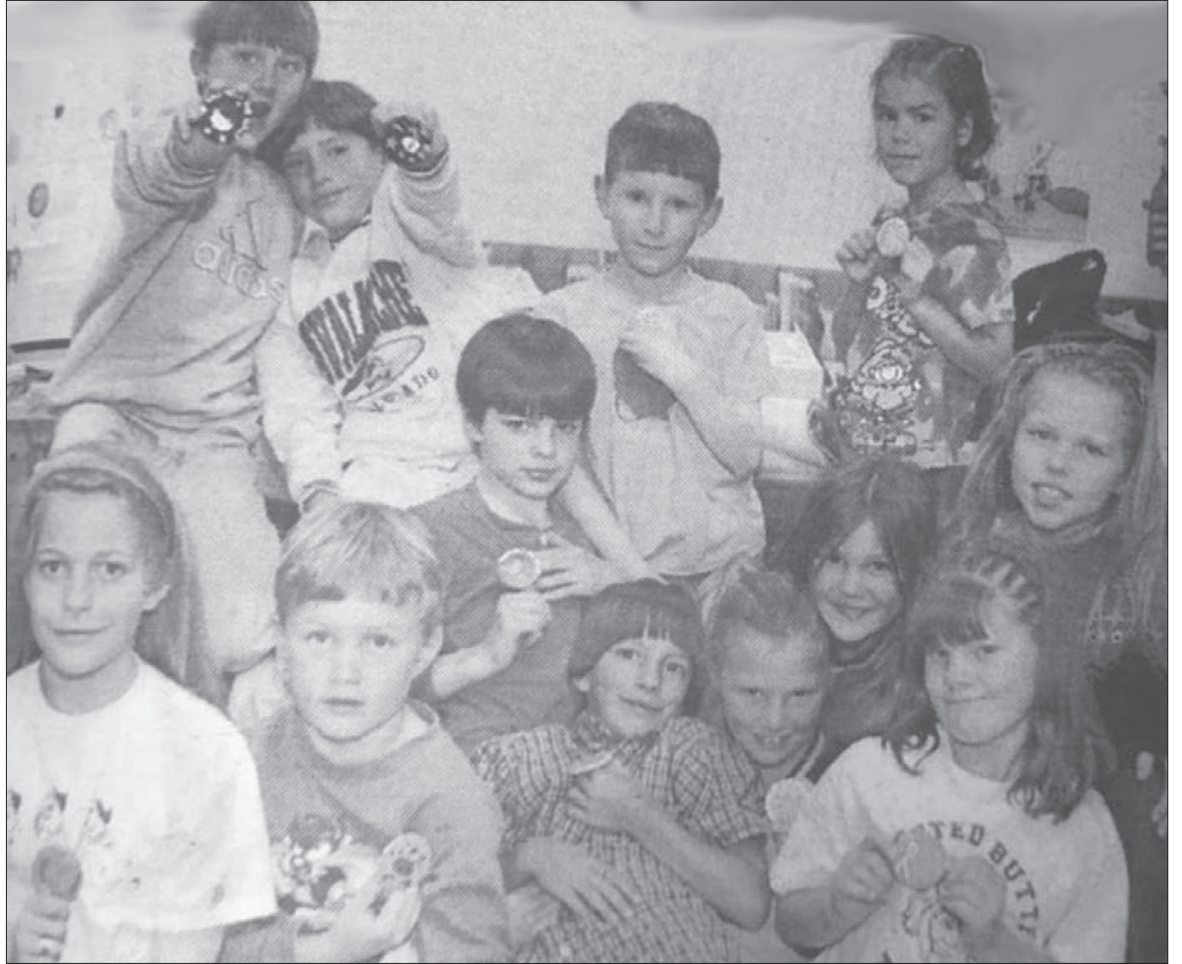
The second grade class raised $415, with the help of the Sunshine Girls, selling buttons they made for the Help for Holly Fund. The fund now totals $8,600.

A topsoil haul is likely in the near future, people are already comparing notes on seeds and there is hope that the garden can be up and running by June 1.