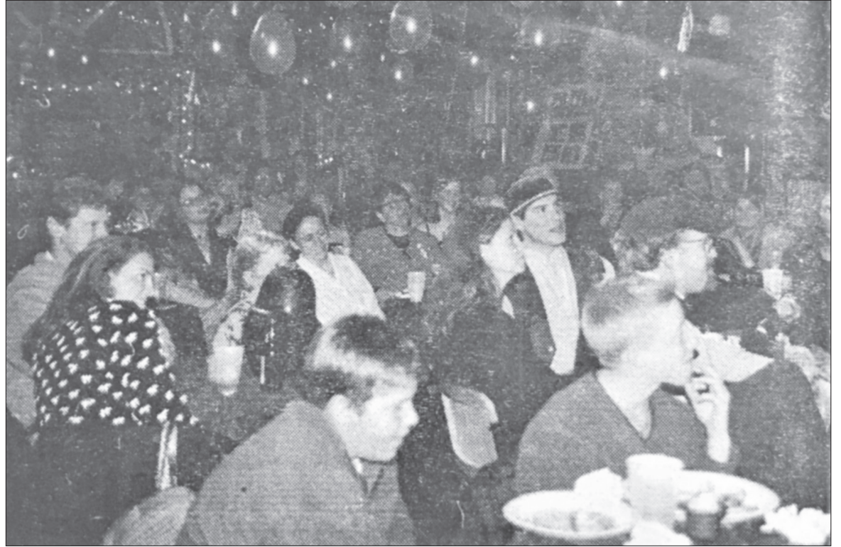
The Golden Marmots packed in the crowds at the Mountain Theater Cabaret last Friday night.

A separate effort has been in the works for more than 40 years and is also currently awaiting its conclusion. When the Aspinall Unit (Blue Mesa, Crystal and Morrow Point reservoirs) was created in 1957, the Bureau of Reclamation made a big promise to Gunnison County residents. In