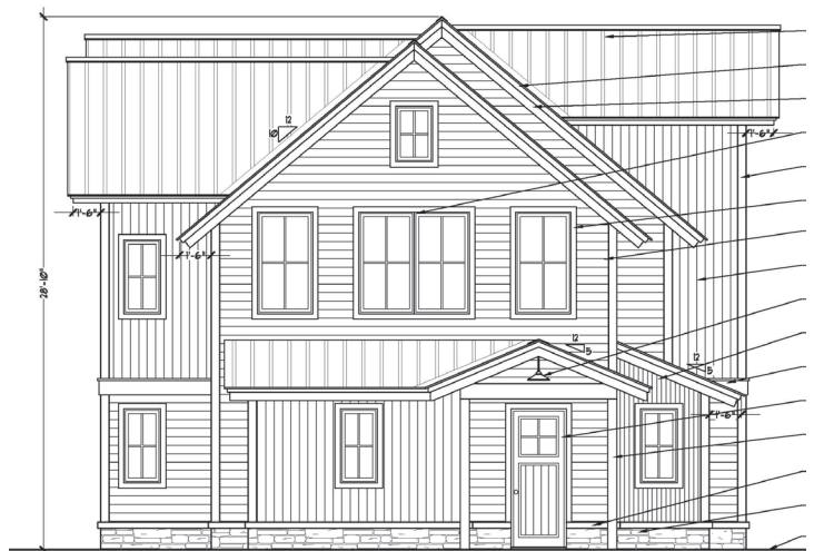
NORTH ELEVATION SCALE: 1/4"=1'-0"

Published in the Crested Butte News . Issues of February 12 and 19, 2021. #021203