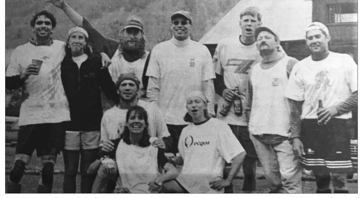
The Anti-Schweiggers came out on top in Crested Butte's Fifth Annual Ultimate (Frisbee) Tournament by defeating the Lazy Drugged Out Morons in a wet and windy final match.