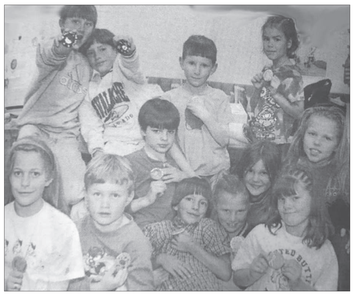
The second grade class raised $415, with the help of the Sunshine Girls, selling buttons they made for the Help for Holly Fund. The fund now totals $8,600.