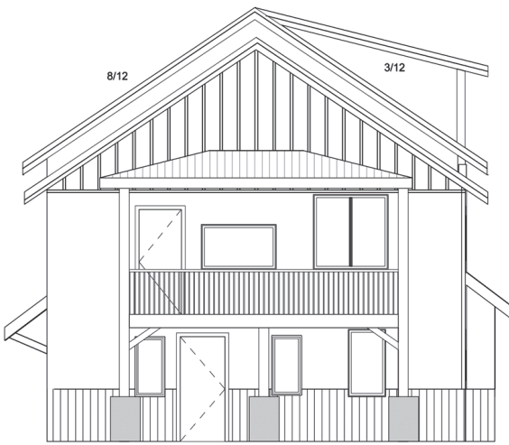
1 Elevation - North 1/8" = 1'-0"

Location: On-line at Uberconference Join the call: https://www.uberconference.com/dom658 Optional dial-in number: 781-448-4005 PIN: 70089 PLEASE TAKE NOTICE THAT a CB South Design Review Committee hearing will be held on Thursday May 20th, 2021 at 6:40 pm for the purpose of considering the following: A Certificate of Appropriateness for the application for a Single-Family Residence with an Accessory Dwelling , Lot 2, Block 19, Filing #2, a.k.a. 15 Brackenbury. A complete set of plans can be viewed at the Crested Butte South P.O.A. Office, 61 Teocalli Road by appointment. This Notice of Public Hearing serves as 14-day public comment period in which comments may be submitted in writing to the Design Review Committee. CRESTED BUTTE SOUTH PROPERTY OWNERS ASSOCIATION DESIGN REVIEW COMMITTEE. Submitted by Dom Eymere, CB South Property Owners Association Manager