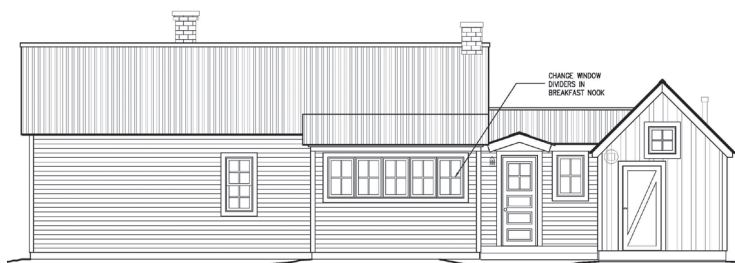
NORTH ELEVATION SCALE: 1/4"=1'-0"