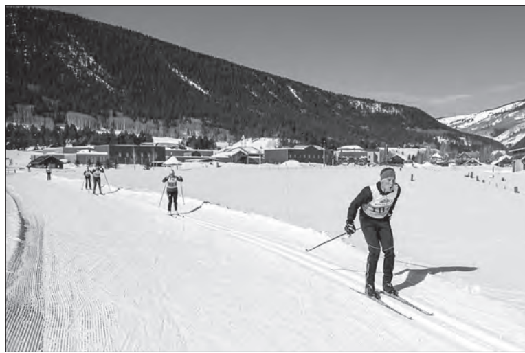
The final CB Nordic race of the season.