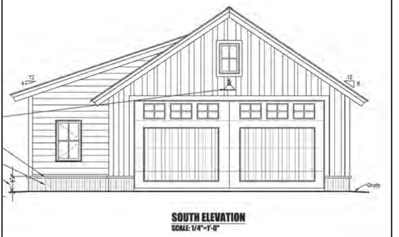
SOUTH ELEVATION SCALE: 1/4"=1'-0"

Published in the Crested Butte News . Issues of April 15 and 22, 2022. #041509