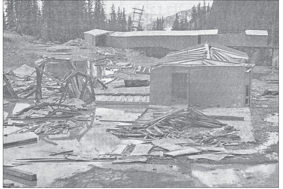
The Standard Mine, pictured here, may be the subject of a federally backed Superfund cleanup.

Consider this our first step out into the mainstream realm of action sports videos. After an intense year of traveling, filming and constant phone calls, the fourth feature film from Two Plank