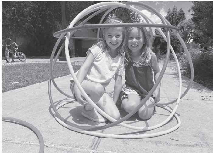
WCU Junior Mountaineers Camp