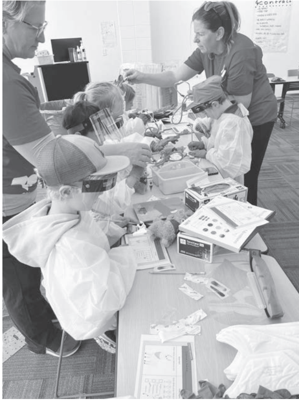
WCU Junior Mountaineers Camp