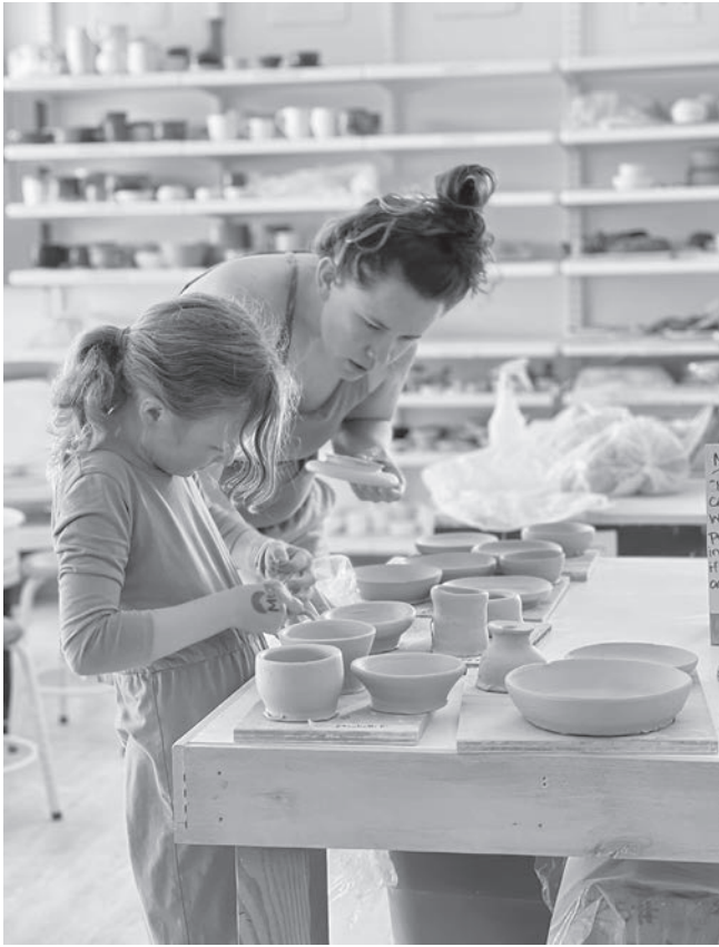
The Clay Studio