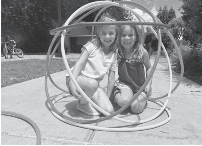
WCA Junior Mountaineers Camp