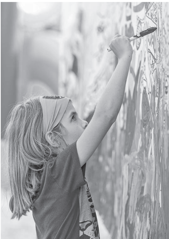
The Trailhead